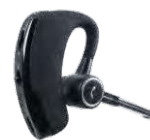
EHW08 Bluetooth Earpiece with PTT Button and Mic