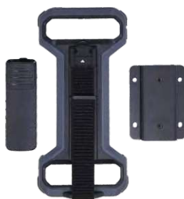
POA207 Protective Case with Hand Strap BRK37 Protective Case with Mounting Bracket BC39 Belt clip for use with POA207