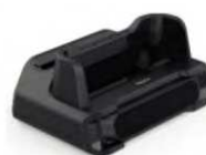
CH20L19 Desktop Charger