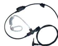
EAS07 Transparent Tube Earpiece with in-line PTT